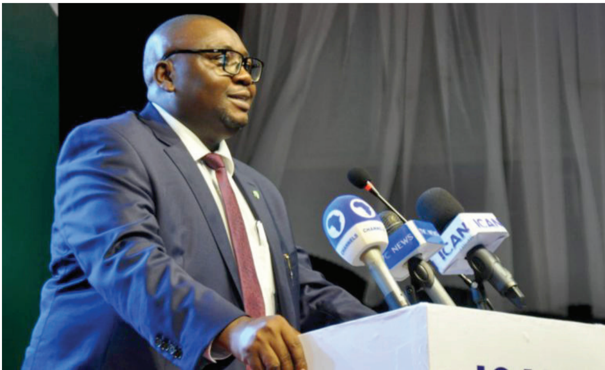
Chief Adebayo Adelabu, Honourable Minister of Power

ed by reform-minded technocrats, the country is taking bold steps to own its resources, process them locally, and reimagine mining and energy as pillars of industrial growth.