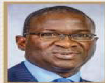
GUEST SPEAKER H.E. Babatunde Raji Fashola, SAN Former Governor Of Lagos State