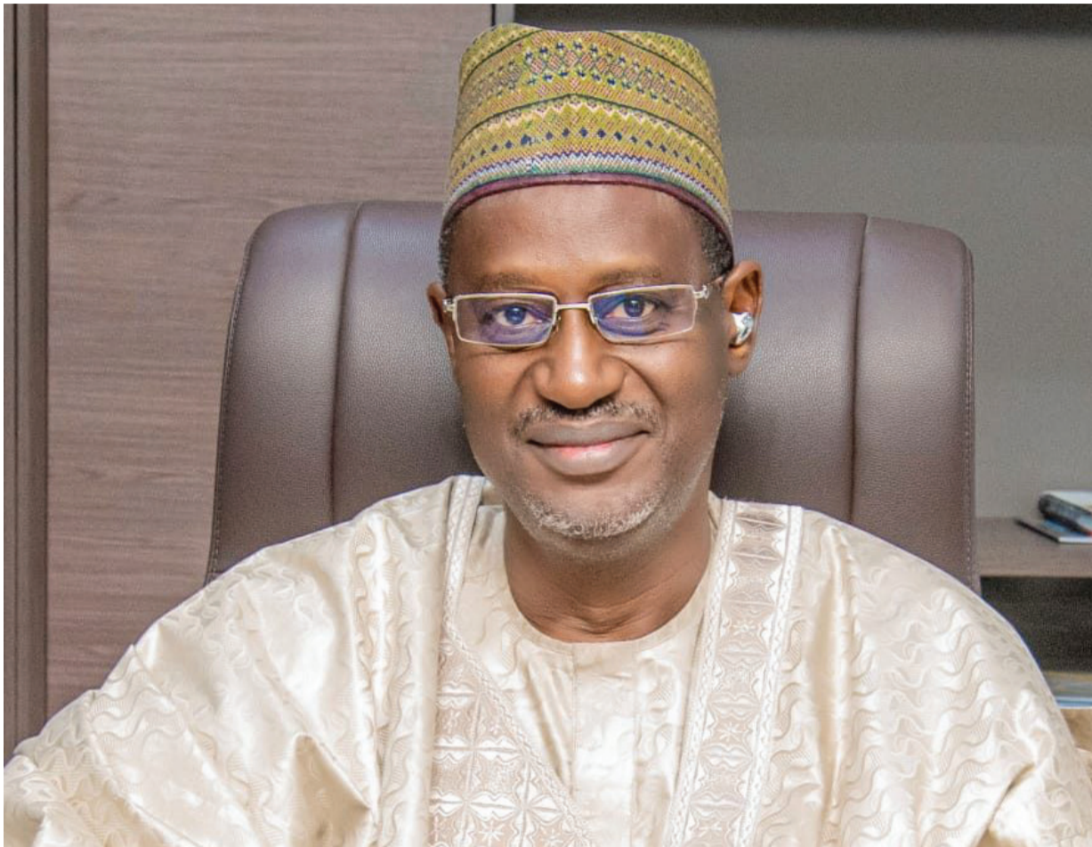
Arc. Ahmed Musa Dangiwa, Honourable Minister of Housing and Urban Development