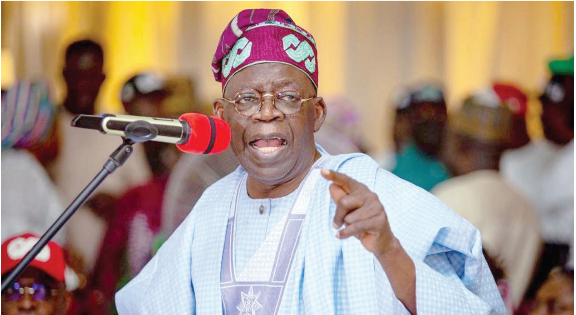
President Bola Ahmed Tinubu