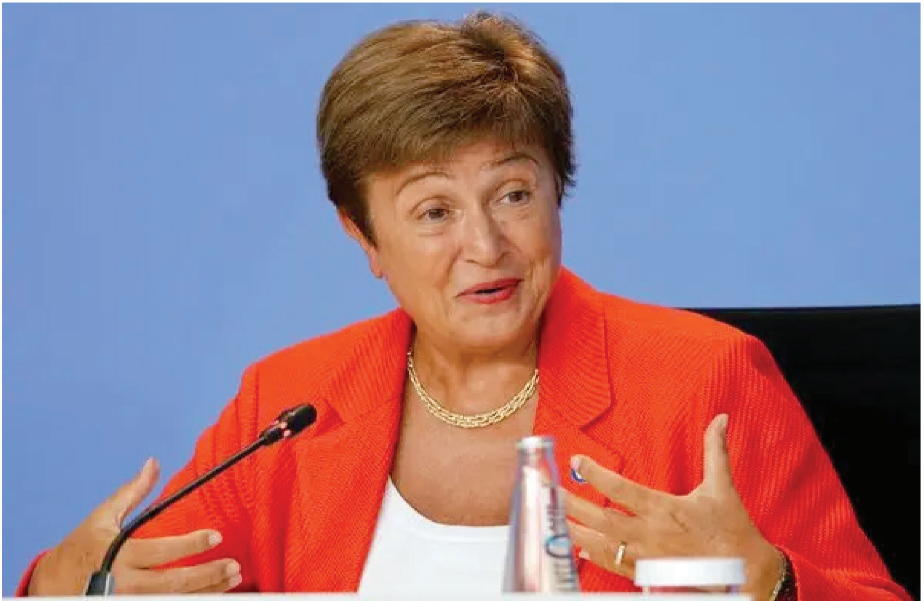
Mrs. Kristalina Georgieva, Managing Director of IMF