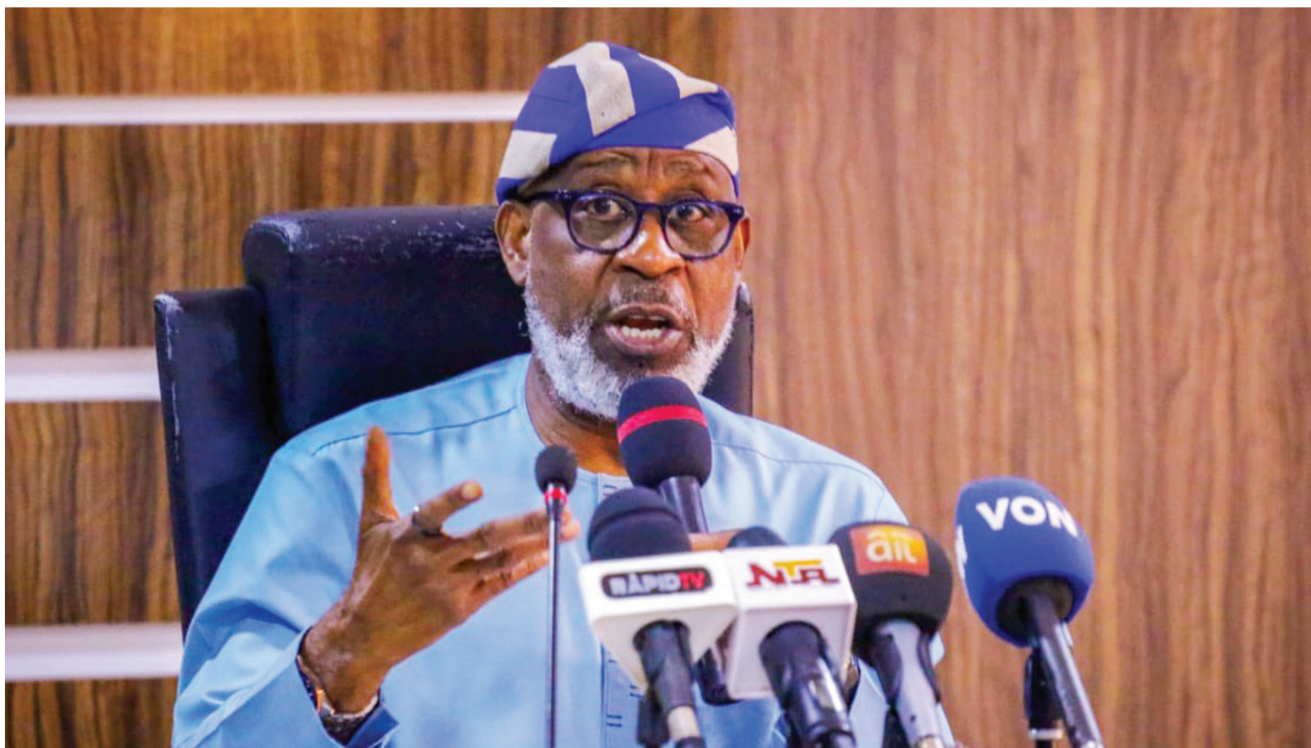
Dr. Oladele Alake, Honourable Minister of Solid Minerals Development

In a continent long defined by the export of raw resources and the import of finished products, Nigeria is turning the page — not with empty ambition, but with bold policy and execution. At the 4th African Natural Resources and Energy Investment Summit, Dr. Oladele Alake , Nigeria's Minister of Solid Minerals Development, made a powerful declaration that encapsulates the new national direction — "Stop exporting