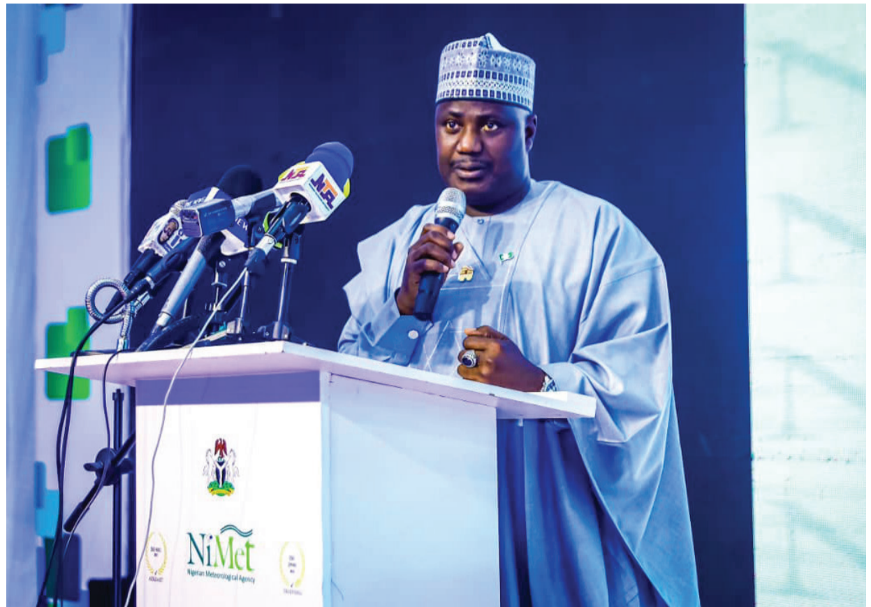
Senator Aliyu Sabi Abdullahi, Honourable Minister of State for Agriculture and Food Security

Senator Abdullahi also spotlighted the government's rollout of Special Agro-Processing Zones