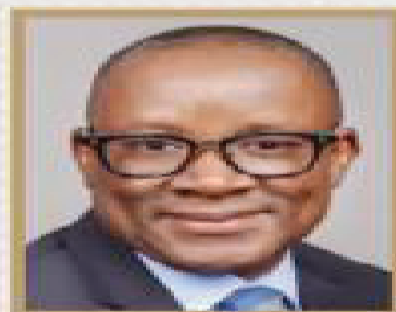
CHIEF GUEST OF HONOUR Senator John Owan Enoh Minister Of State For Industry