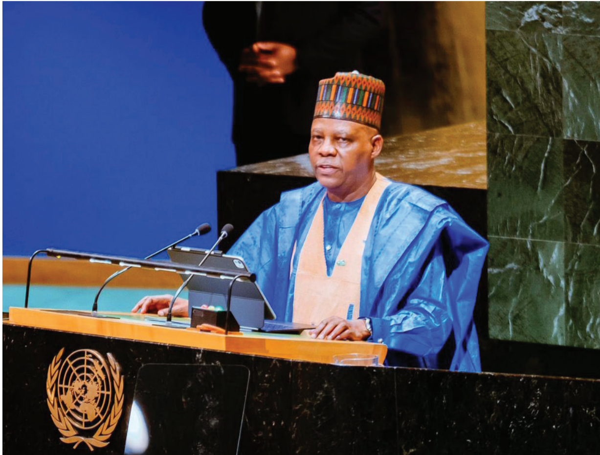
Vice President Kashim Shettima