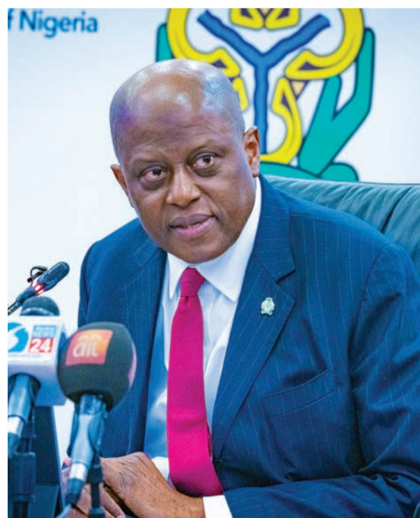
Mr. Yemi Cardoso, Governor of CBN

while maintaining merchant banks' CRR at 16%. However, it introduced a 75% CRR on non-Trea-